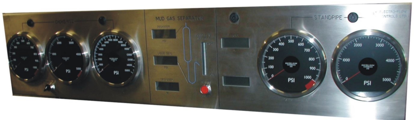
Finescale Pressure Gauges with Liquid Seal Monitor & Temperature displays