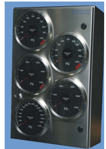
Vertical FSG 35

Unlike hydraulic systems, no manual isolation is required as gauge limits are reached. EFC's electronic solution ensures no damage to gauges or sensors.