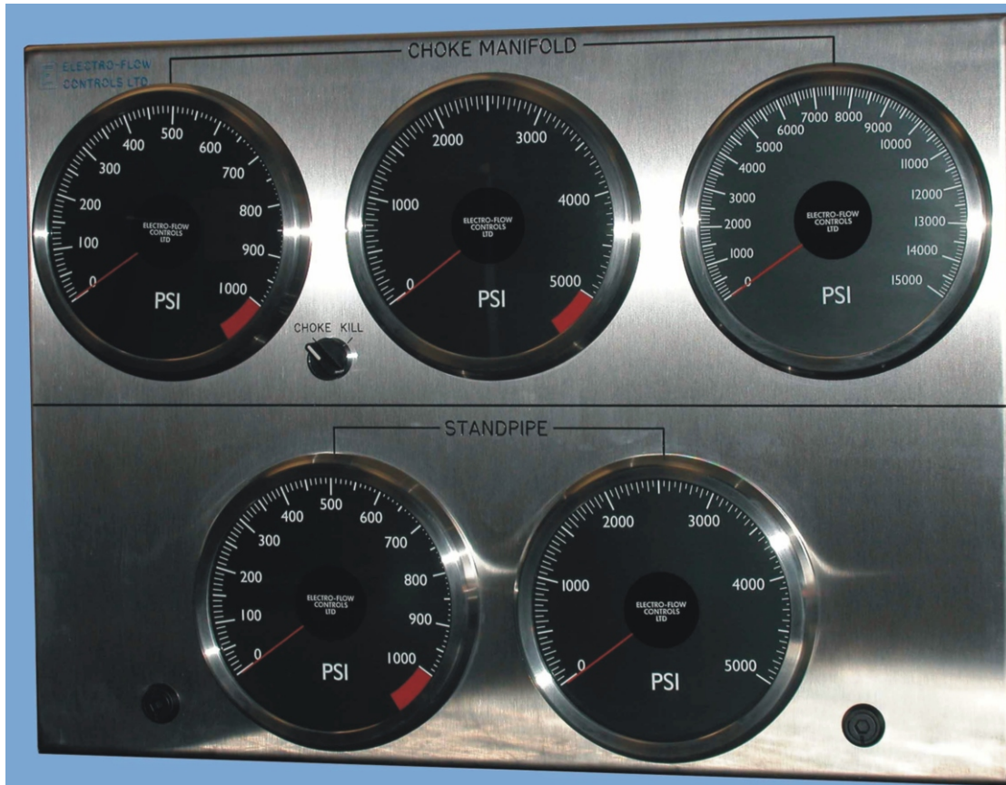
Horizontal FSG 35

EFC's family of Well Control Instrumentation adds value to the Choke Control System of any rig. Our WCI package is a real speciality, comprising - Finescale Gauges, Liquid Seal Monitor, Advanced Choke Control, HPHT Monitoring and Overboard Valve Control.